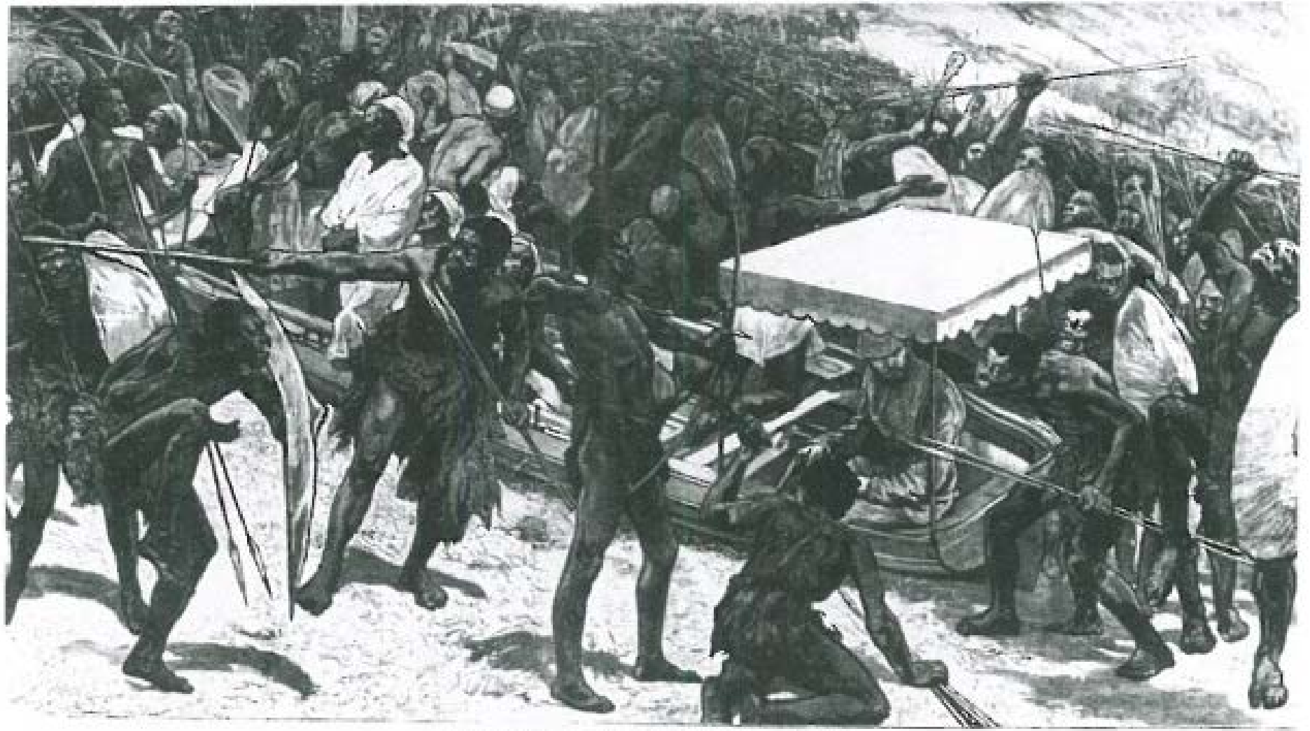
Stanley in Africa. Popularized depictions of blackness and savagery underwrote an ideology of united, consanguine whiteness. Harper's Weekly , 1878.