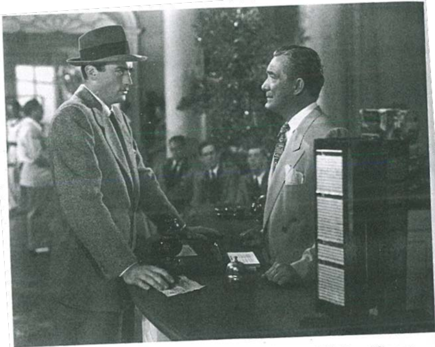
Failing to pass (2): marked by an unmistakable physiognomy, Phil Green (Gregory Peck) is granted entry to a restricted resort, until he arouses suspicions by asking about the hotel's policy of restriction. Gentleman's Agreement , Fox Studios, 1947.